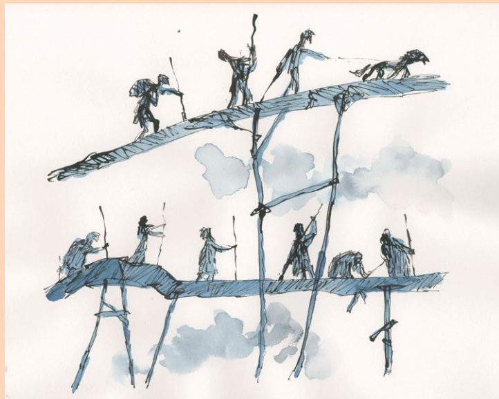
Sir Quentin Blake, from High Places series, 2023.