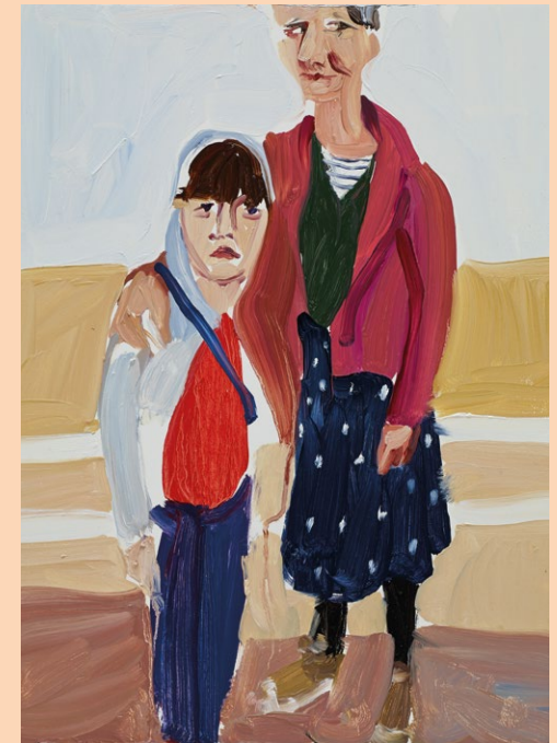
Top: Maggi Hambling, Cormorant Rising, 2020. Bottom: Chantal Joffe, Self Portrait with Esme on the Promenade, 2014.